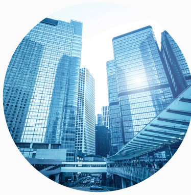
Corporate M&A The Elite Band 2