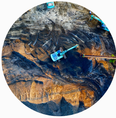
Energy and Natural Resources: Mining Band 1