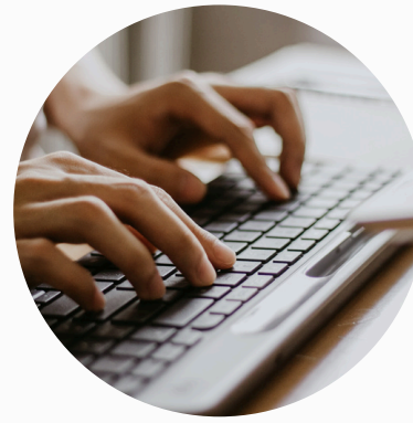
NEW Compliance Band 2