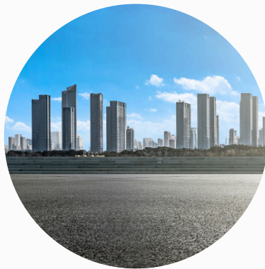
Bankruptcy and Restructuring Band 3