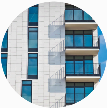
Real Estate Band 3