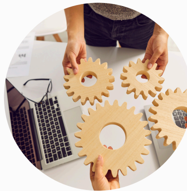
Labour and Employment Band 4