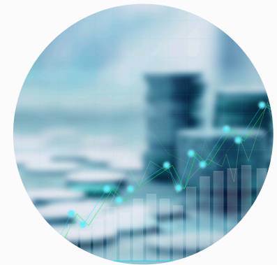
Banking and Finance Band 4