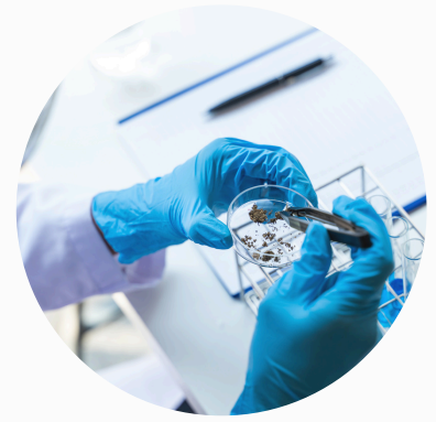
NEW Life Sciences Band 3