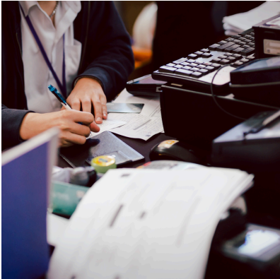
Banking and Finance